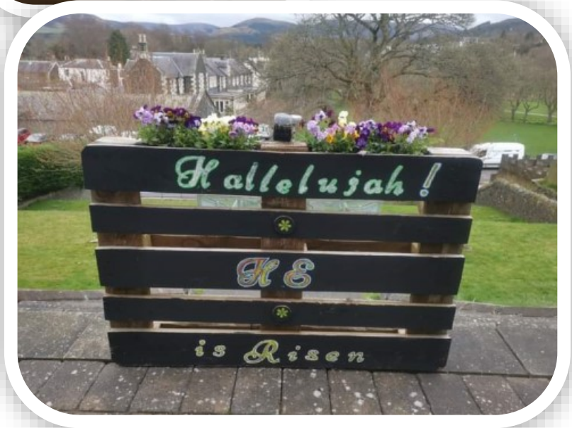
The flower displays inside and out were a joy to see