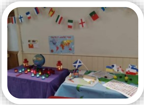
Prayer Time Activities in the Church