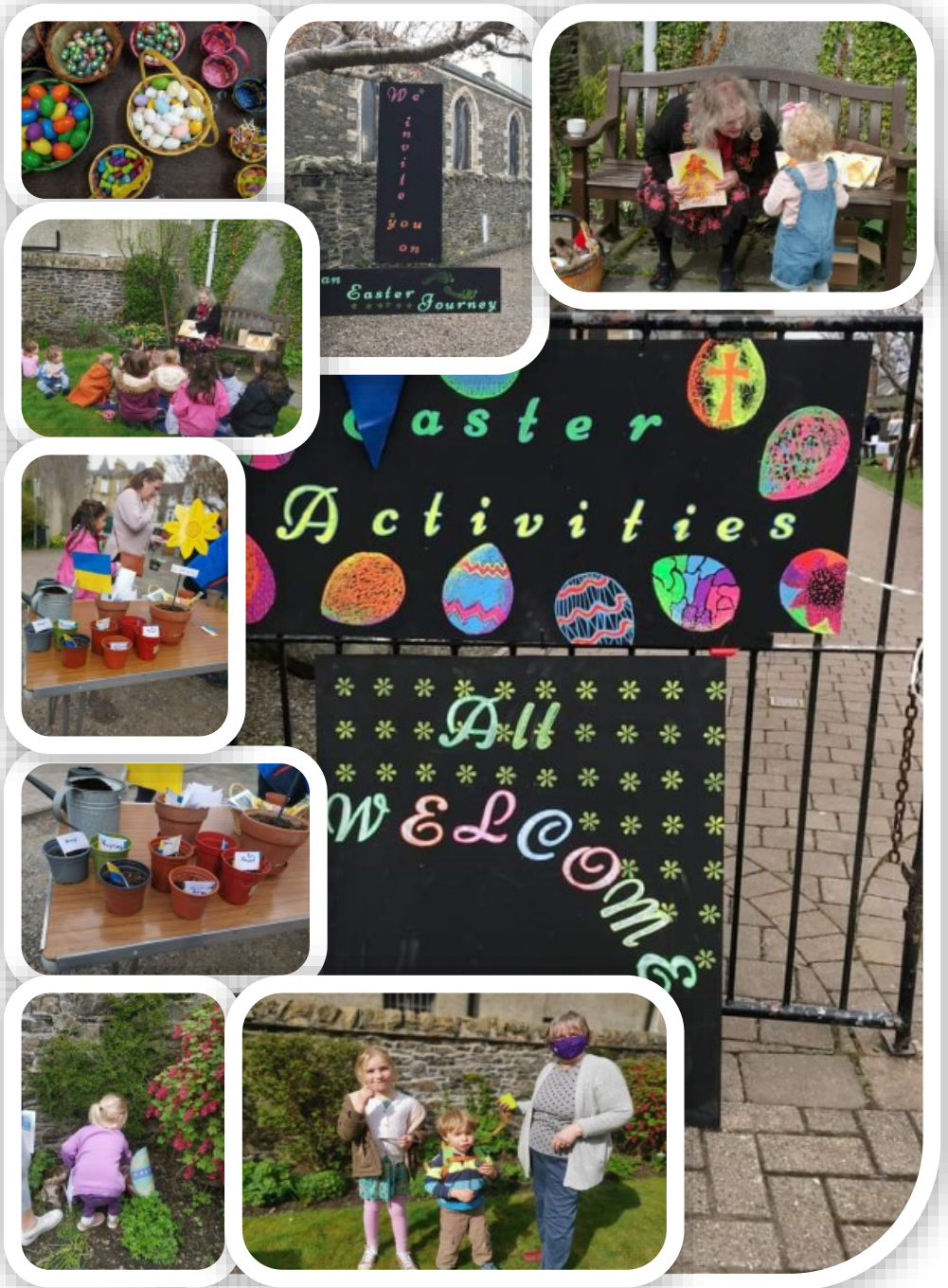
Easter Saturday morning with lots of activities