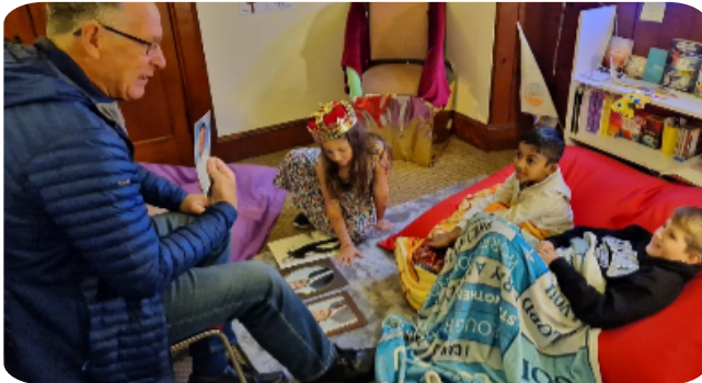
Time praying in the quiet of the prayer space.

We are looking forward to the remainder of this series, and also looking ahead with anticipation to the Christmas period – don't miss our family Nativity service on 22nd December!