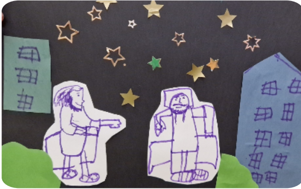
Our pictures of Nicodemus meeting Jesus