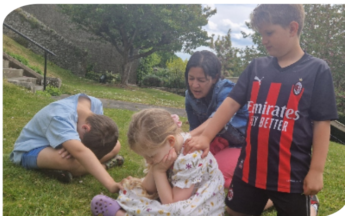
Children praying for each other during Sunday Club time.